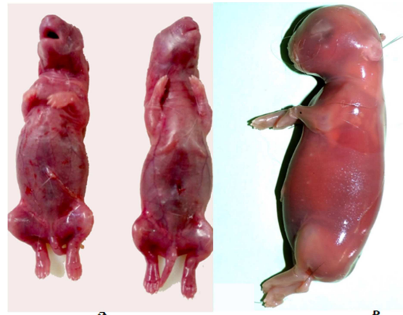
Figure 1: Photograph showing samples of the 29th day old fetuses of the control group (A) and treatment group (B)

The axial and appendicular skeletons of the rabbit fetuses of the treatment and control groups were stained red, while the muscles did not take the stain. So that it was easily to identify the details of the parts of the normal skeletons and these with anatomical disorders. The fetuses were clear and the skeletons were seen through them. In the fetuses of the control group, the axial skeleton including skull with mandible, vertebral column, sternum, ribs and caudal